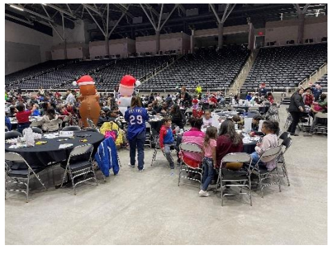
Children's Christmas Party