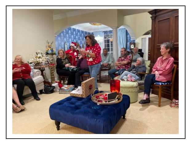
CLUB CHRISTMAS PARTY