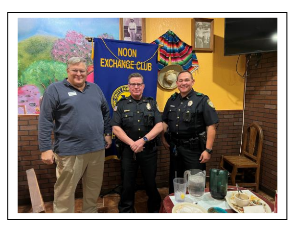
You Make a Difference with Garland PD