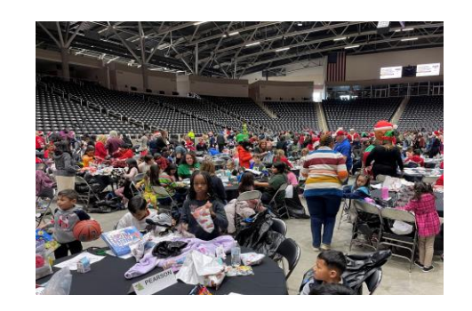
Children's Christmas Party