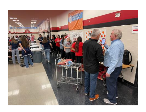
Wrapping at N. Garland H.S.