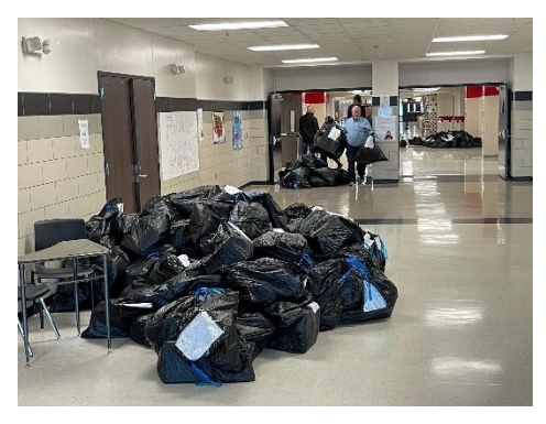
Gift Wrapping at North Garland H.S.