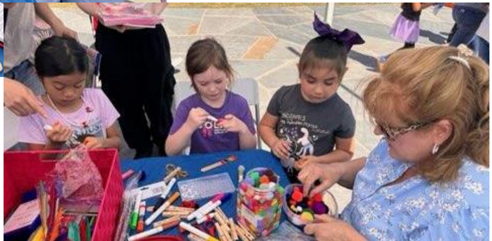
Making Bugs, getting Tatoes, and learning about Exchange Club